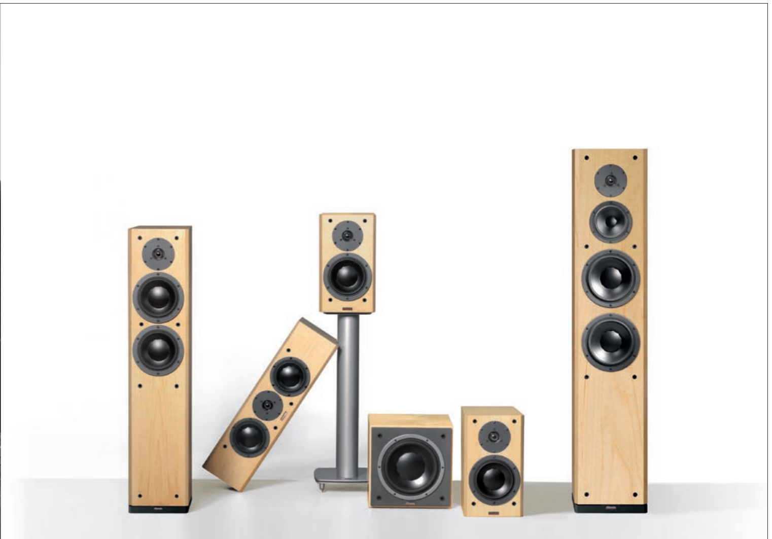
The variety of the Focus series: Focus 220 II, Focus 200 C, Focus 140 on Stand 4 , Sub 250, Focus 140 and Focus 360.