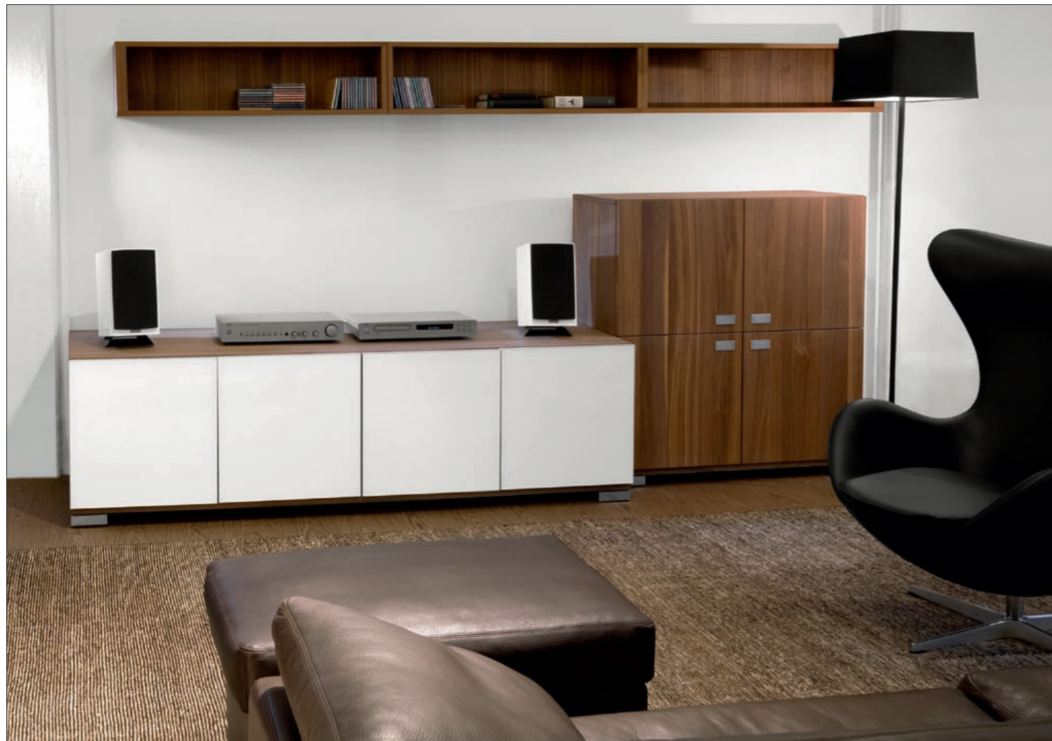
A pure musical experience. The traditional hi-fi system, condensed to the essentials.