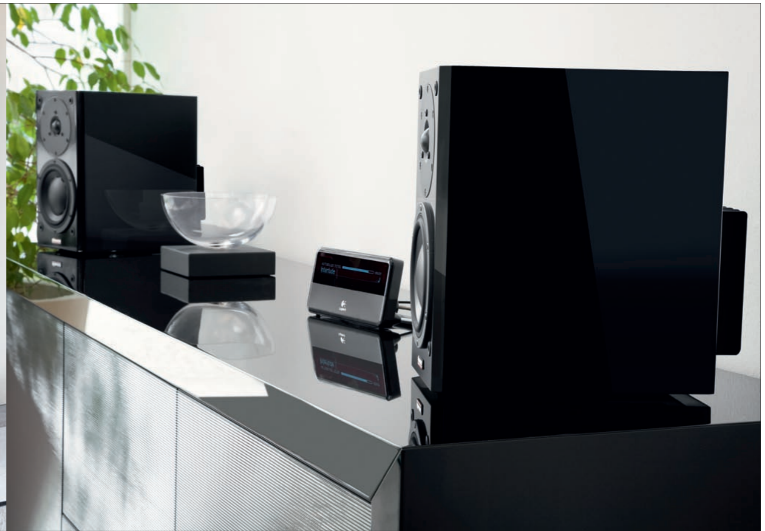
Music, pure and simple. Higher sound quality from compact media players.