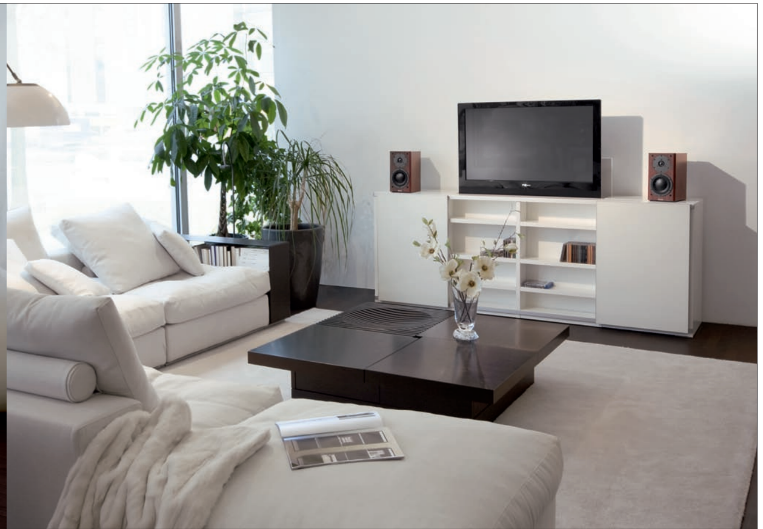
Surround sound made flexible. With active speakers, system expansions can be carried out step-by-step.